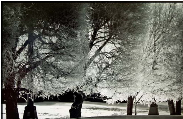
HM Brushed with White Paule Hjertaas, Regina