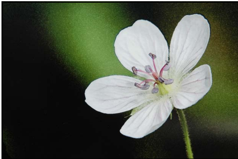
Best Nature & Best of Show - Wild White Geranium Larry Easton, Regina Photo Club