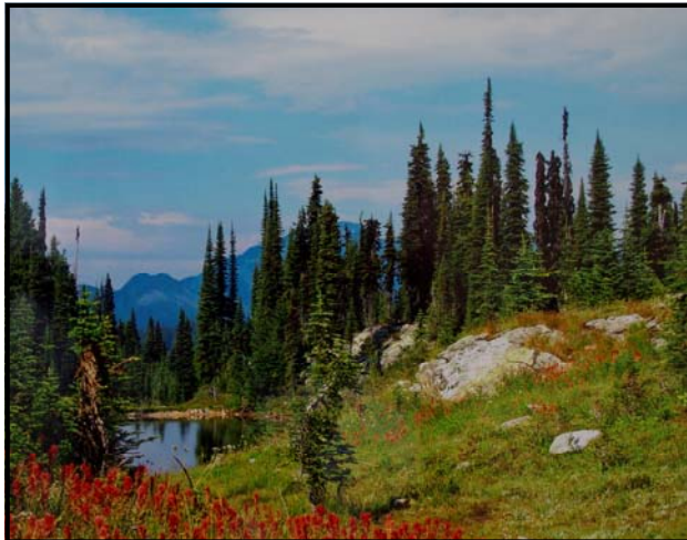
3rd Mount Revelstoke Eldred Stamp, Wild Rose