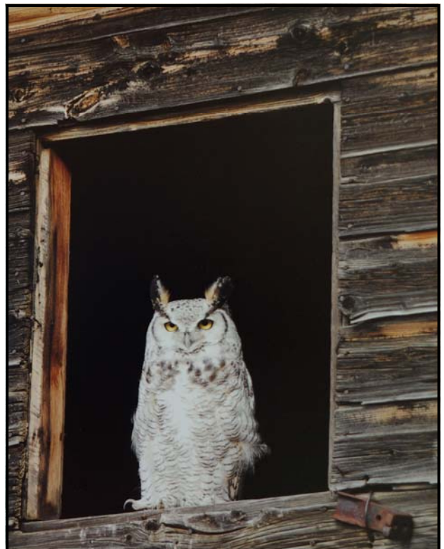
HM Who's Watching Who? Rella Lavoie, Gleneath