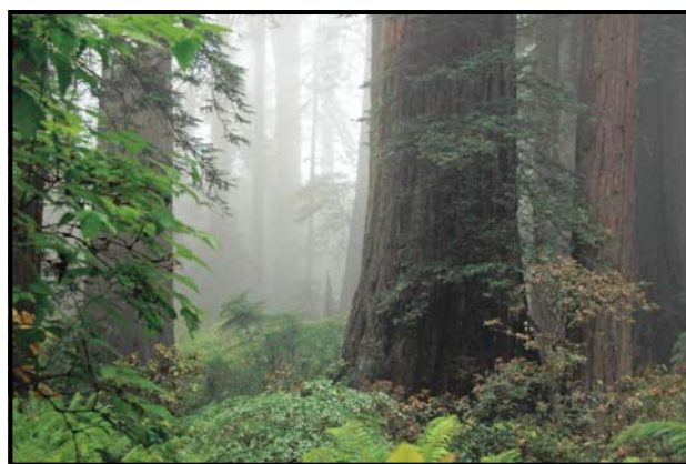
Best Landscape - Morning Mist Roxanne Paslawski, Gleneath