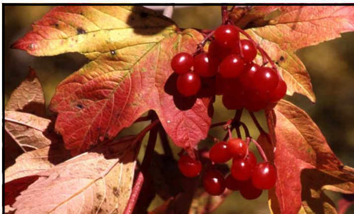
Highbush Cranberry By Rella Lavoie Gleneath Camera Club Best Nature & Best of Show

EVEREST CLUB SLIDE COMPETITION Judged by Rosetown Photography Club - 37 entries CLUB TROPHY WINNER: GLENEATH CAMERA CLUB