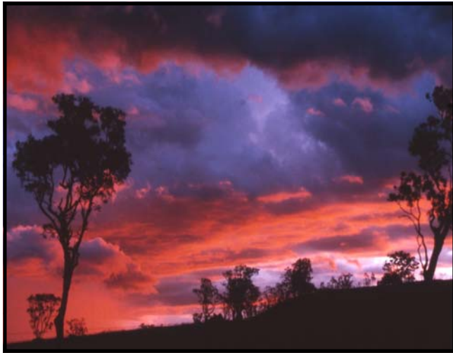
Outback Sunset by Ann Dies Gleneath Camera Club Best Landscape