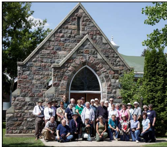
Stone Chapel