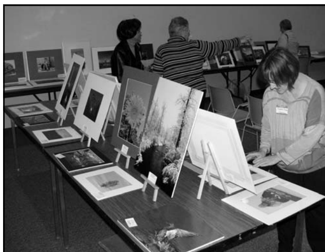
Print competition entries as well as the Print Exhibition were on display at the AGM