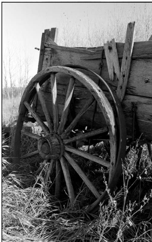
Put Out to Pasture

Congratulations to Foothills Camera Club for their fine photography and for once again retaining the Challenge Cup! They are now looking forward to the next challenge from another club.