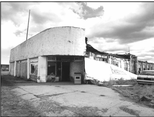
Open / Closed by Wilma Gamble, Individual HM, Russell Slide Competition [originals: color slides]